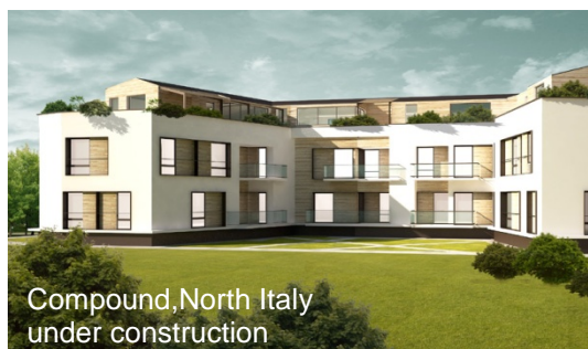
Compound, North Italy under construction