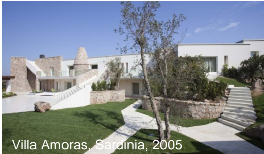
Villa Amoras, Sardinia, 2005