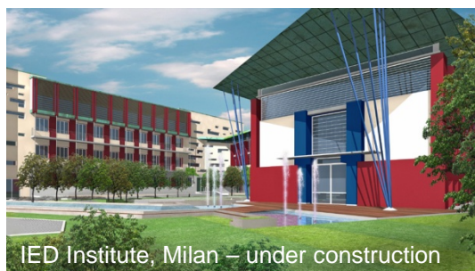
IED Institute, Milan – under construction