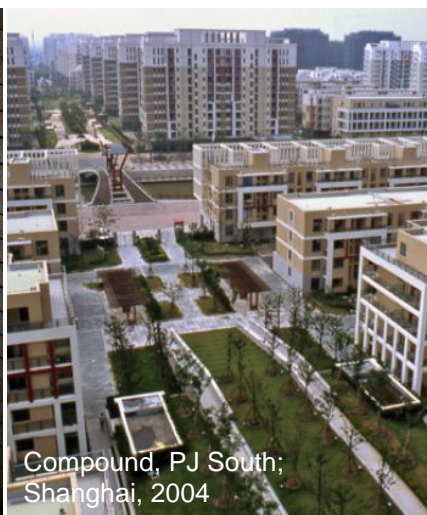
Compound, PJ South; Shanghai, 2004