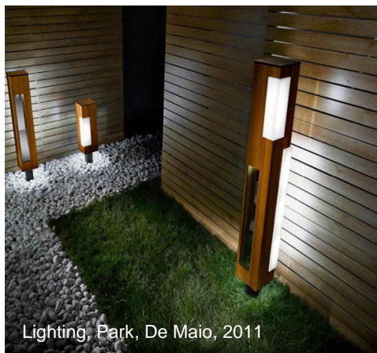
Lighting, Park, De Maio, 2011