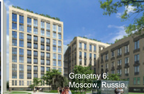
Granatny 6, Moscow, Russia,