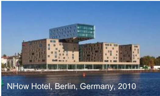
NHow Hotel, Berlin, Germany, 2010