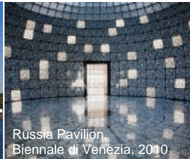
Russia Pavilion, Biennale di Venezia, 2010